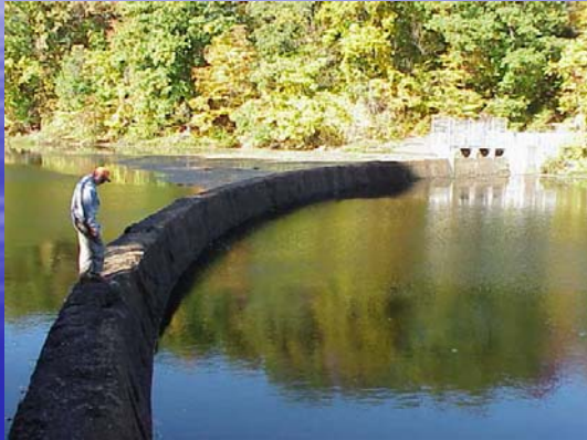
Class A Low Hazard Potential